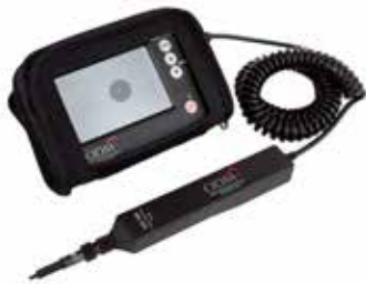
Visual Endface Inspection