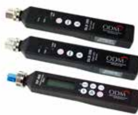
dB Loss Testing